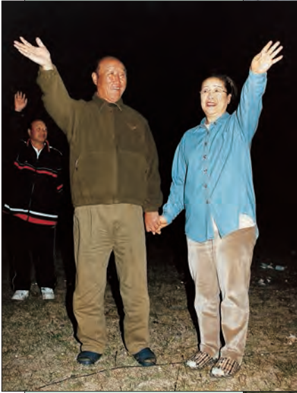
Right: True Parents meet with a group of Jardim workshop participants at the HotelAmericano Above: Saying farewell