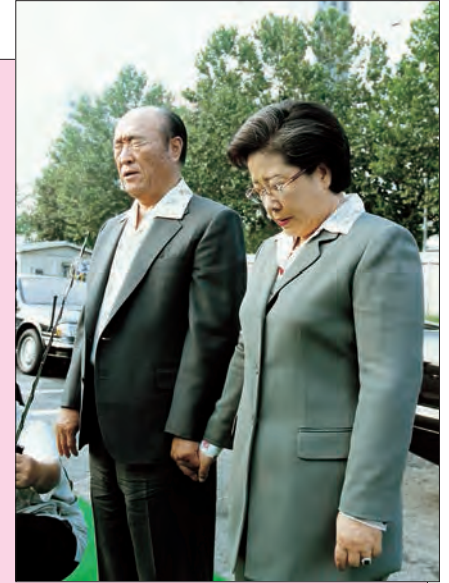
True Parents pray at the Yoido Holy Ground on their arrival in Korea