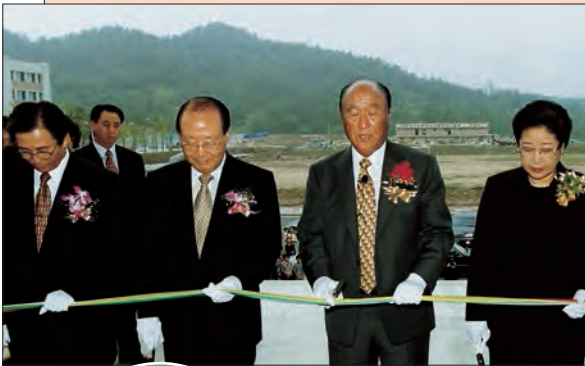
True Parents open a new student facility at Sun Moon University on September 12. Father wrote "Choong Joong Shim" which can be expressed "Place the center of your heart in loyalty."