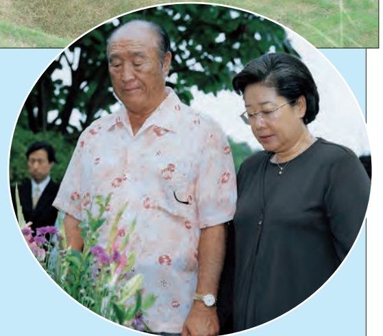
True Parents visit and pray at the Wonjeon during their mid-September sojourn in Korea