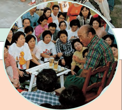
Left: Father speaks at the Ideal Family Education Headquarters at New Hope East Garden Below: Father, Mother and leaders admire a large baku