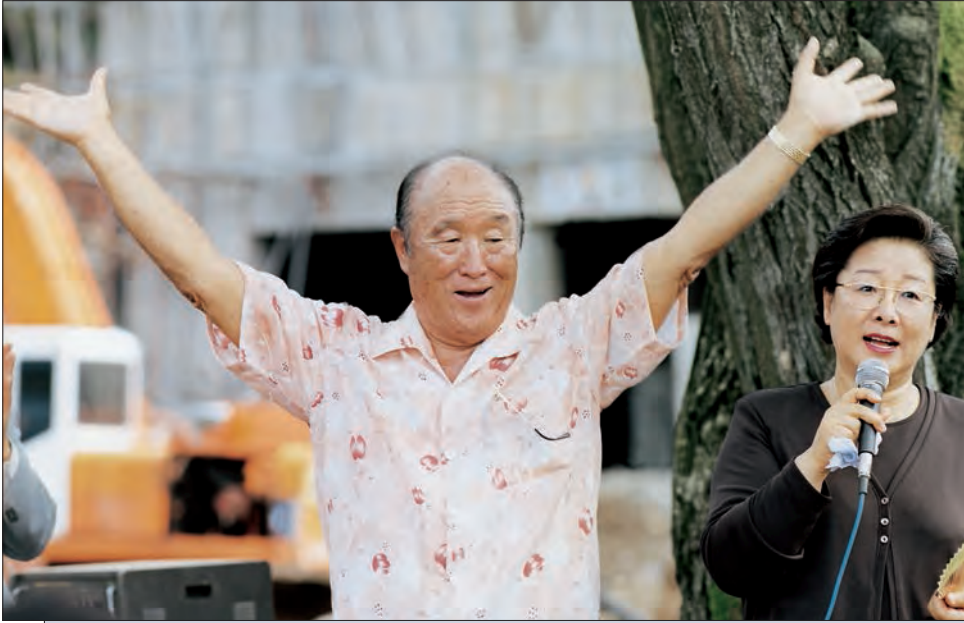
True Parents sing on a visit to inspect the nearly complete Cheonsung Wanglim Palace at Chung Pyung, in mid-September