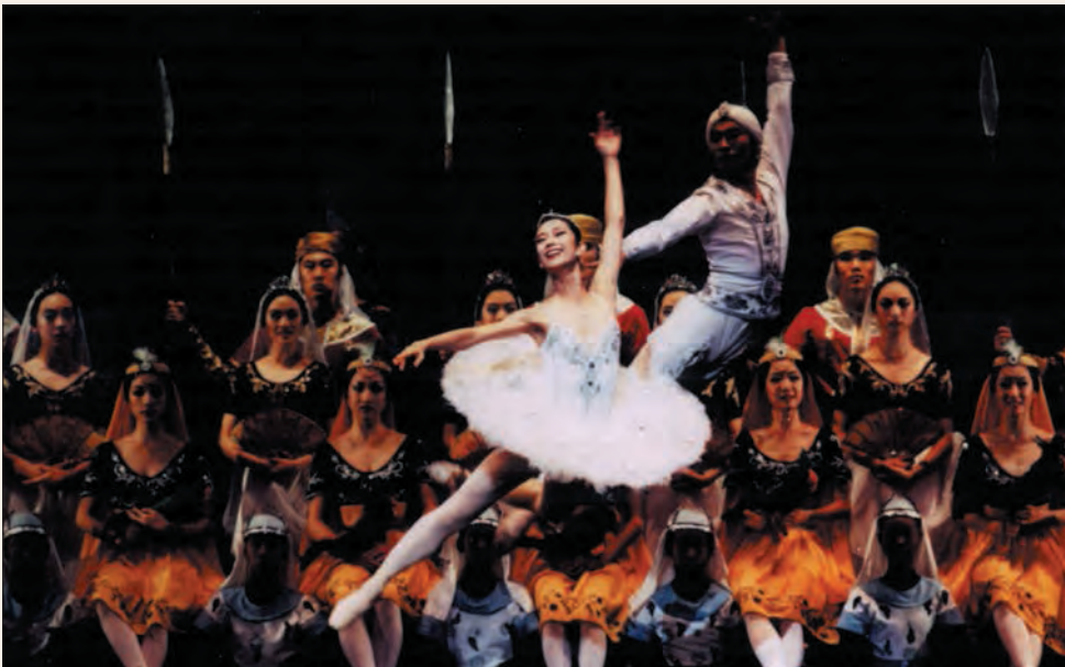
Universal Ballet in preparation for the company's November premiere of La Bayadère at the Sejong Cultural Center in Seoul

October 20, 1999 [Presidential Seal Affixed]