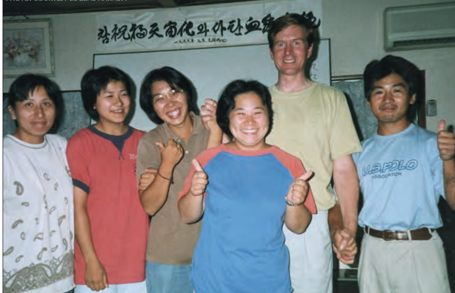
With Japanese "micro bus" fundraising team members

I actively sought to embrace their heart and could weep in prayer each day, feeling united with my Japanese family. After three days there, I had a dream that I was held by my mother, Japan, and taken to Korea and embraced by True Father with such a love as I had not known before, a warm, familial comfort. It became crystal clear to me the principle that we cannot but go through the Mother to get to Father.