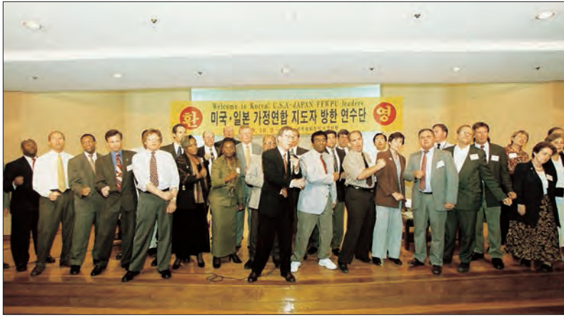
The leaders from the United States sing at the ceremony to welcome them and their Japanese counterparts to Korea, October 2, at the Down Building in Seoul

heart with our Korean Church brothers and sisters. Who could believe such a common feeling transmigrates over the oceans and cultures between us? Only due to Father's training, by the hand of our True Parents' love, have we become one. This trip by American and Japanese brothers and sisters who went to Korea confirmed what we know deep down in our hearts already: we are one in heart. It takes not 40 days to realize this. Members in America can realize this immediately based on the foundation of heart now existing.